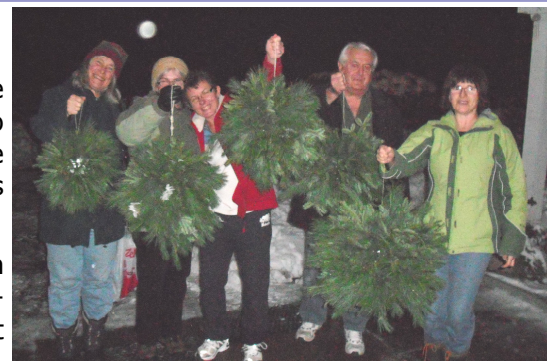
Garden Club members with their Christmas projects