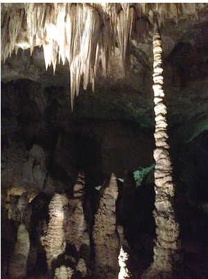
Stalagmites in Carlsbad Caverns

It does not rain often in the desert, but when it does, it rains steadily. The rain began during our last day in Tucson. The desert ground does not absorb rain and drainage systems are easily overwhelmed. Some roads were closed due to flooding. It rained most of our drive from Tucson to Silver City, New Mexico. After the deluge, the sun returned for the remainder of our visit in New Mexico. In Silver City, we hiked a trail with some ancient petroglyphs and a trail with huge rocks formed by ancient volcanoes. We visited some cliff dwellings at Gila Cliff, named after the nearby river. It is believed that the Ancestral Puebloan people that left their cliff dwellings in Mesa Verde, Colorado may have migrated to this area.