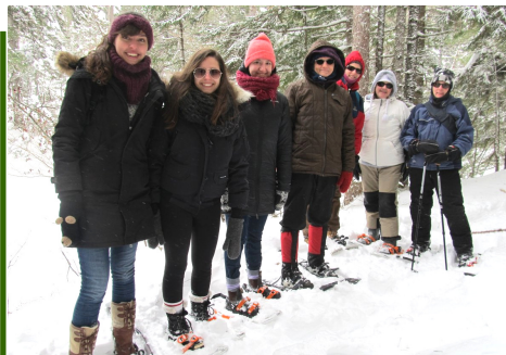
River Ridge Common Hikers. Hikes sponsored by MODL