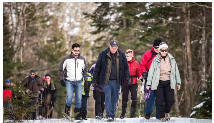
MODL hike to Carver's woodlot this winter.