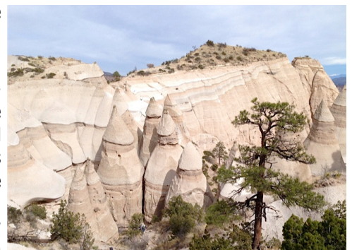
Kasha-Katu Tent Rocks National Monument

During our stay in Bernalillo, we visited the Georgia O' Keeffe museum and the Museum of Indian Arts and Culture in Santa Fe. We toured the Indian Pueblo Cultural Center and the Petroglyph National Monument in Albuquerque. We hiked a trail at Kasha-Katu Tent Rocks National Monument. Tent rocks are also referred to as hoodoos. We had not seen these vertical columns of rock since our time in Utah! We also visited the Pueblo of Jemez, one of nineteen pueblos in New Mexico. We learned more about the impact on the Native American culture when the Spanish Conquistadors, in the Coronado expedition, arrived in 1541.