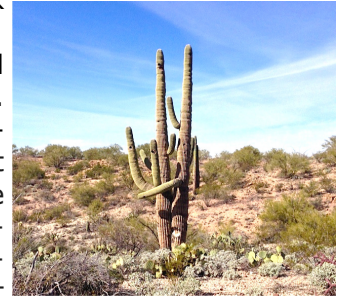
Saguaro Cactus in the Sonoran Desert

During our two weeks in Tucson, we visited museums and art galleries, and spent many hours outdoors basking in the sun and enjoying the Sonoran desert. The Sonoran desert has a variety of unique plants and animals, such as the Saguaro and Organ Pipe cactus. At the Arizona-Sonora Desert Museum, we met some desert animals such as snakes, javelinas and prairie dogs. On a shuttle ride through Sabino Canyon, we enjoyed some breathtaking views of the Sonoran desert. We also visited the Biosphere 2 near the Catalina Mountains, north of Tucson. It is called Biosphere 2 because the structure is modeled on Earth, the first biosphere. Within a glass structure, there are 3.14 acres of eco-systems from the ocean, mangrove wetlands, tropical rainforest, savanna grassland and fog desert.