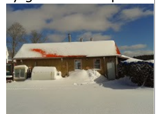
Sugar Shack @ Farm

(Always welcome, but please call or email first to make sure we are home.)